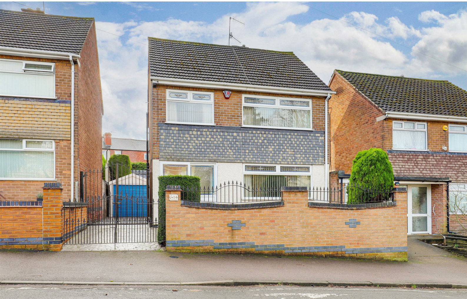
Colston Road, Bulwell, Nottinghamshire NG6 9JY